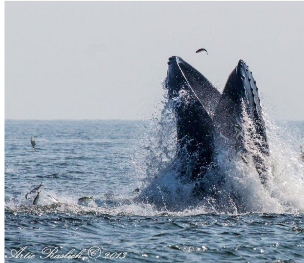
Artie Raslich, © 2013 Artie Raslich, Gotham Whale